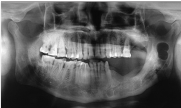
Figure 3: Panoramic radiograph of the patient in 2016

region to the ascending ramus of mandible on the left side was observed.