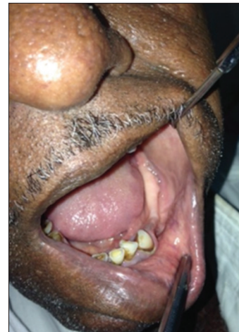
Figure 5: Intraoral picture depicting missing teeth and vestibular obliteration on left lower buccal vestibule