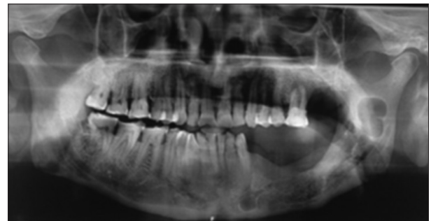
Figure 6: Panoramic radiograph of the patient in 2017

of 33 to 0.5 cm above the inferior border of the mandible and anteroposteriorly from distal 32 to distal 33 with well-defined sclerotic borders suggestive of replacement type of KCOT. Missing teeth were 34, 35, 36, 37, and 38 [Figure 6]. The patient was then advised for enucleation and curettage and chemical cauterization with the use of Carnoy's solution.