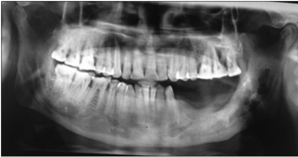
Figure 1: Panoramic radiograph of the patient in 2012